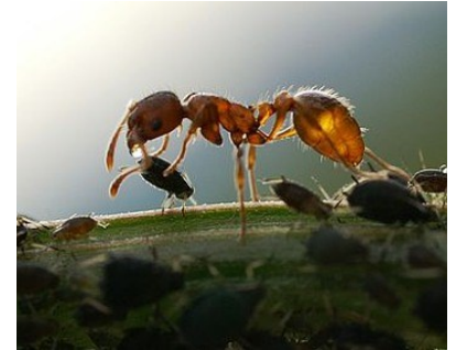
Ant harvesting aphid honeydew

May be taken as Lecture-only or Lecture + lab (lab recommended)