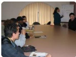
February 1 - 3, 2008 Oregon State University Corvallis, Oregon

Hosted by a different Oregon public university every year, the Oregon Students of Color Coalition (OSCC) Conference brought over 250 students for over 70 workshops on issues impacting communities of color and the skills to create change. Participants met and networked with students of color and allied students and heard from speakers making change now in our communities. The OSCC Conference is the most affordable conference of its kind!