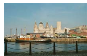
University of Liverpool