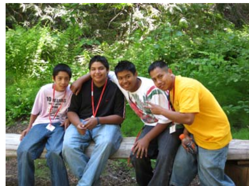
Tech Camp participants with Bridges mentor