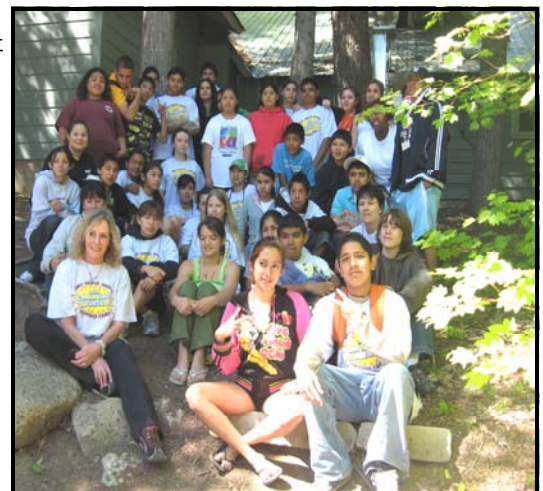
Students at Camp Zaneka Lache