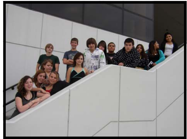
Oroville's School Quest Students