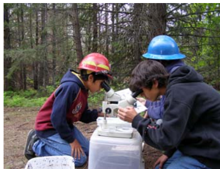
Students in hard hats examine water bugs at the Tripod fire area in June