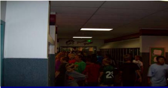
Welcome Back to School