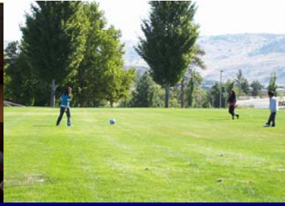
Soccer & Hoops after Lunch