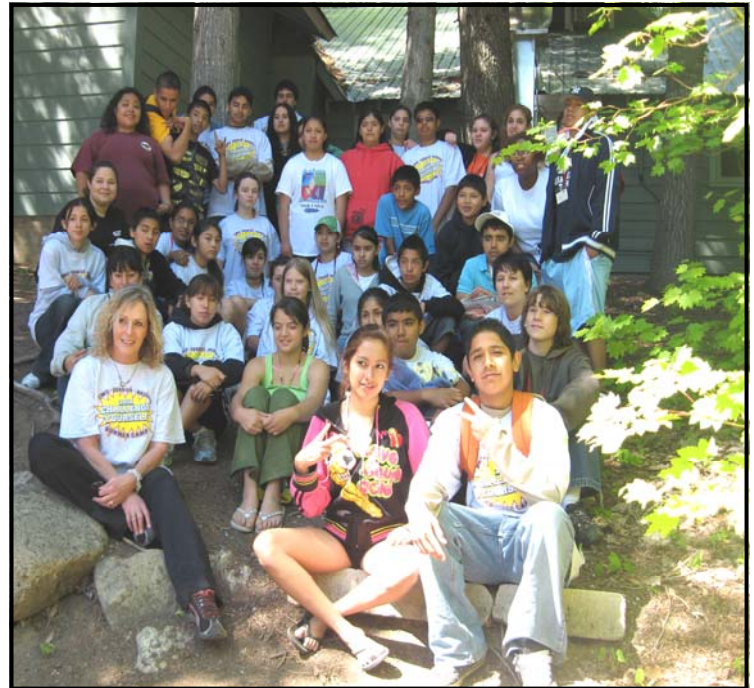
GU Students (Bridgeport and Brewster) at Camp Zaneke Lache at Lake Wenatchee on the last day, before heading out to Chelan Water Slides.

Every evening students watched the days activities using computer technology and journaled the best thing and worst thing they experienced