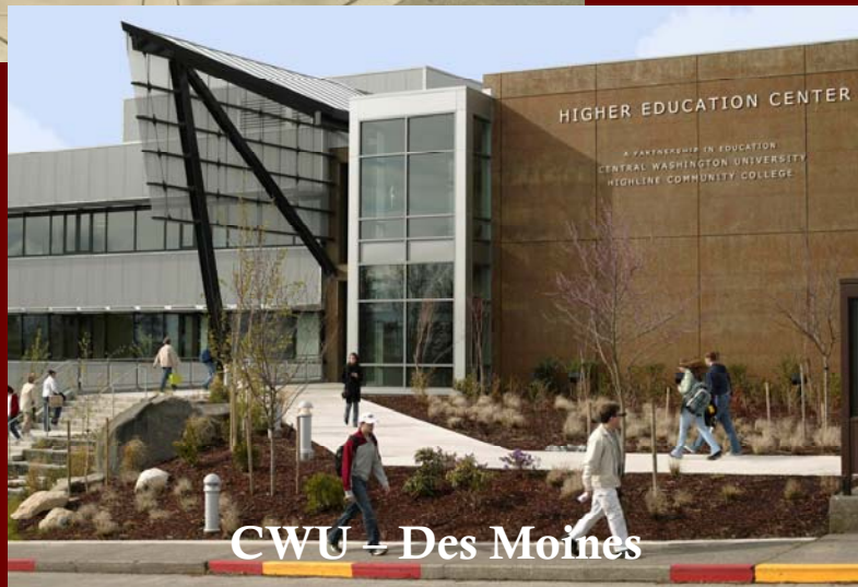
CWU – Des Moines