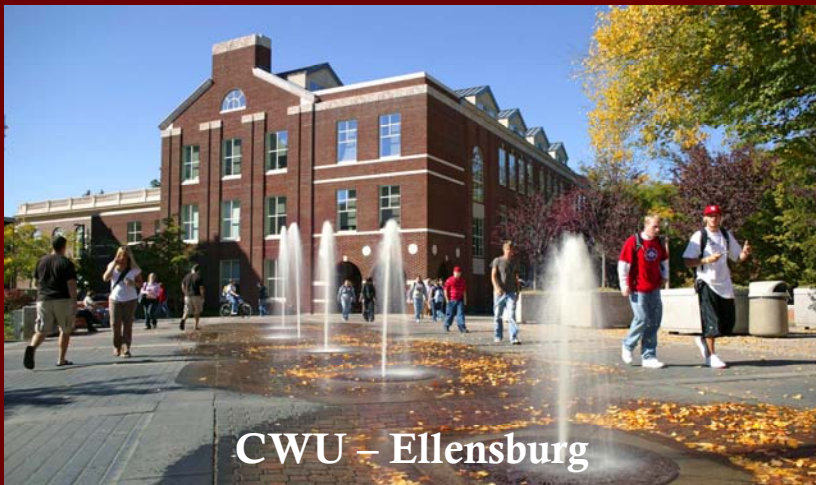
CWU – Ellensburg