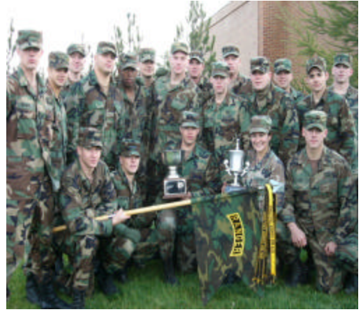
Ranger Challenge Team Army ROTC