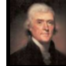
Thomas Jefferson's Birthday

The President's Address to Civil Service Employees: 10:30 a.m.- noon and 2:30-4 p.m., SURC Ballroom