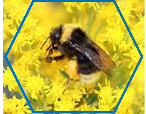
Native bumble bee