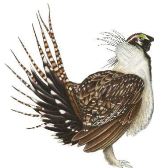
Greater Sage-grouse ( Centrocercus urophasianus )