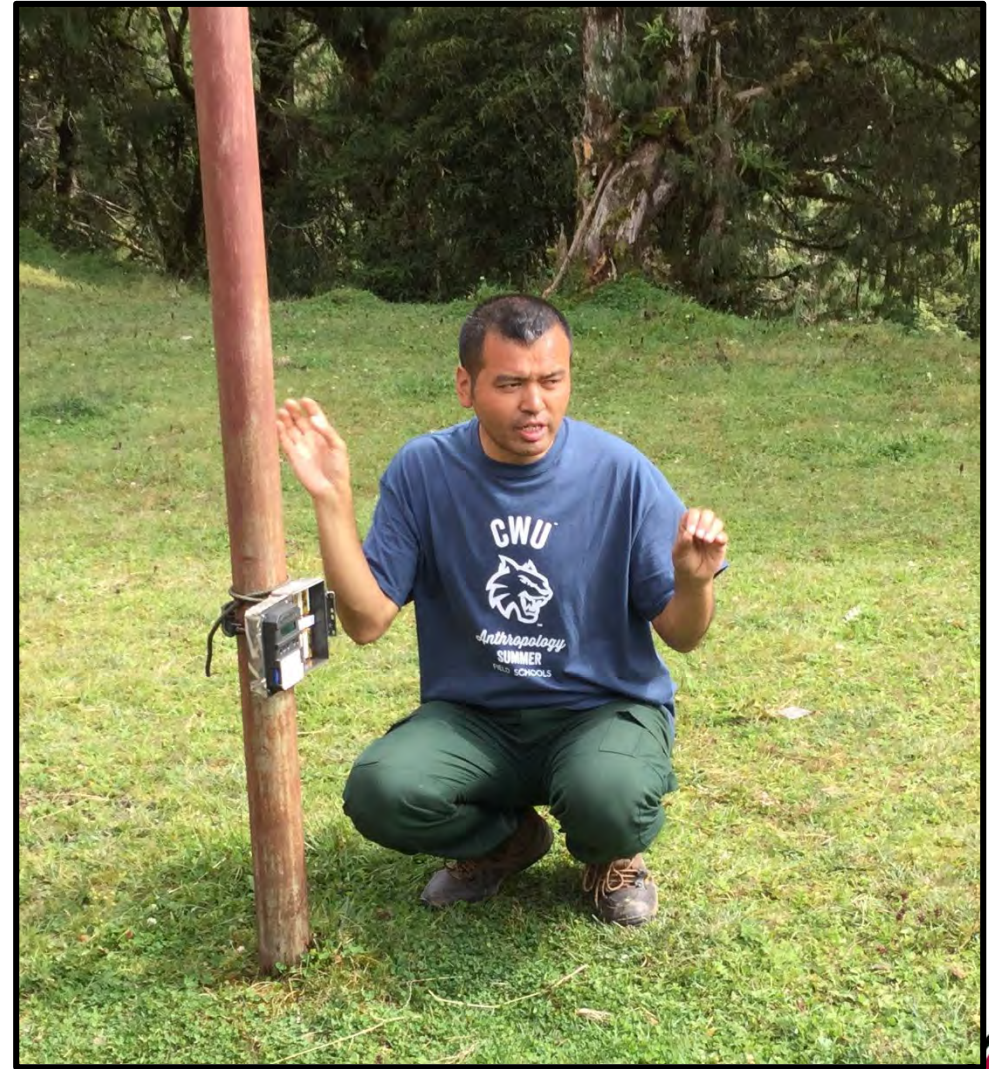
Place camera traps to see elusive species