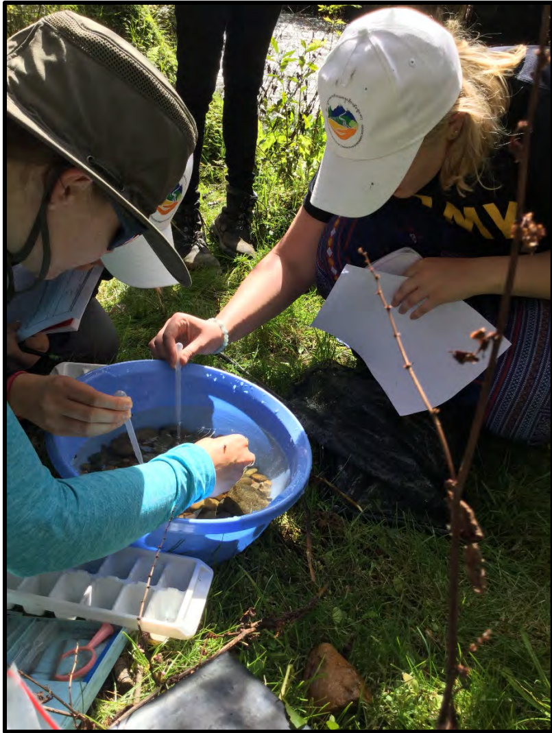
Record freshwater invertebrates