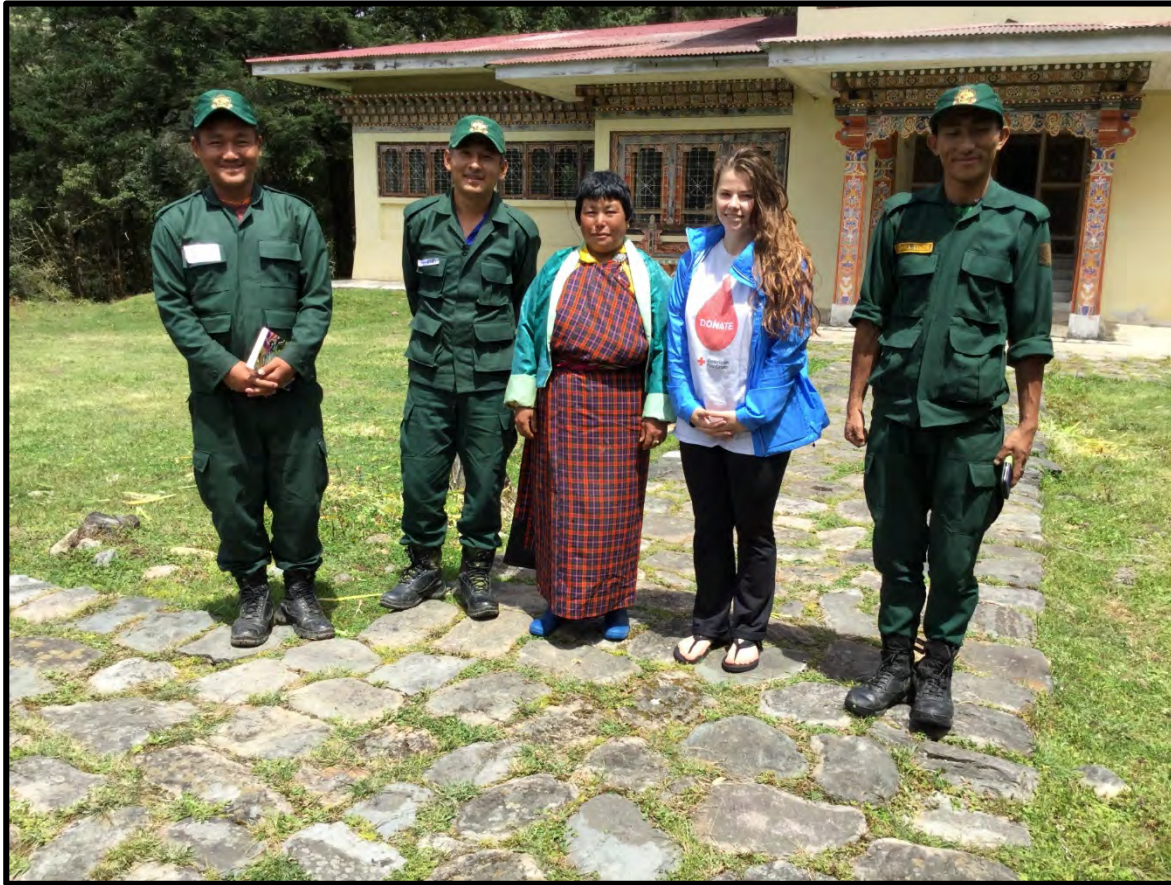
Conduct ethnographic interviews