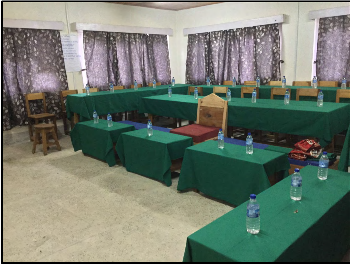
Classrooms accommodate up to 45 people