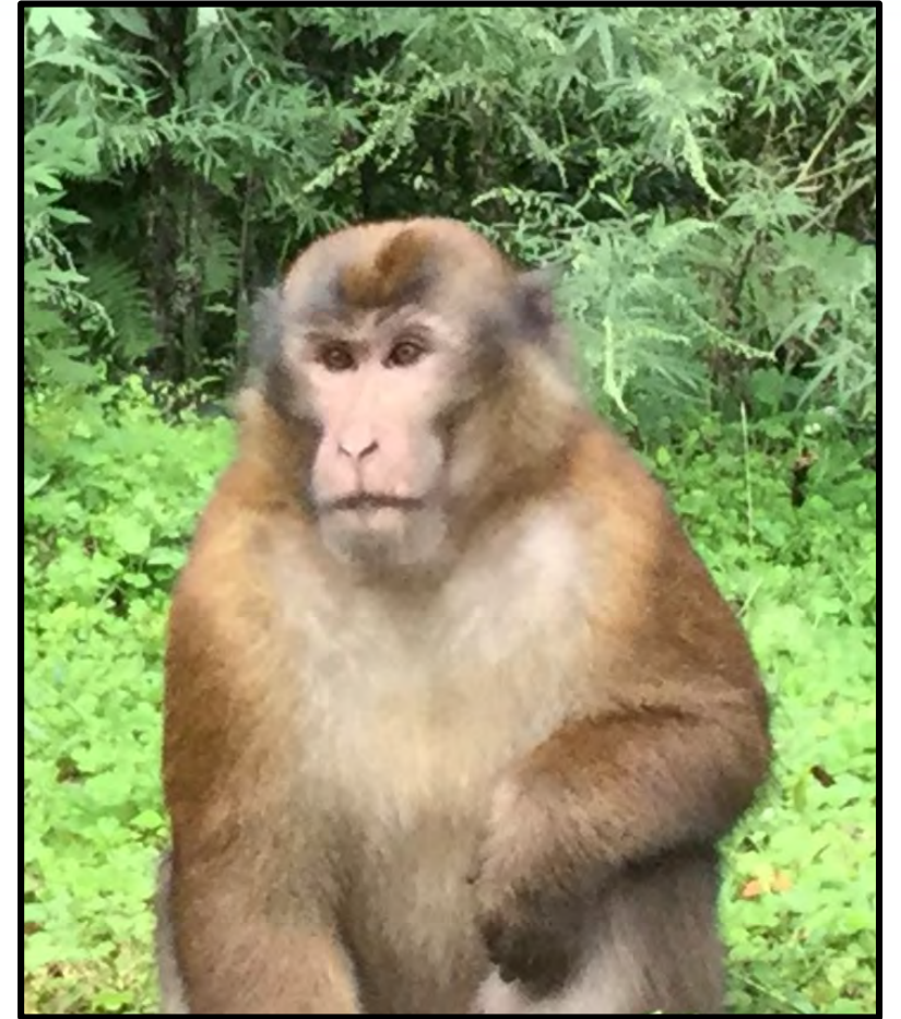
Central Himalayan langurs, golden langurs, and Assamese macaques are 3 common primate species