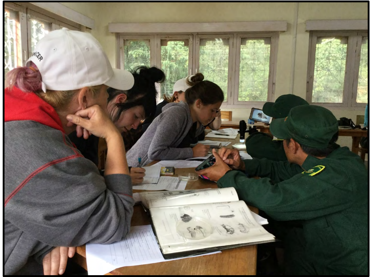
Learn from experts in the classroom and in the field