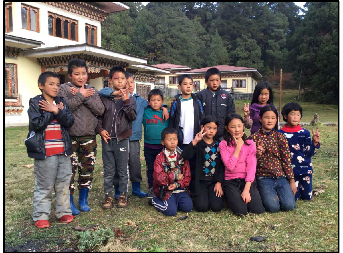
Engage in conservation-themed educational outreach with local children