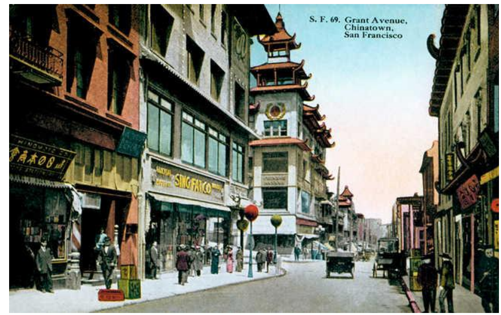
Fig. 8. Grant Street, 1910. Post Card, Pacific Novelty Company. (accessed December 10, 2014)<sup>15</sup>