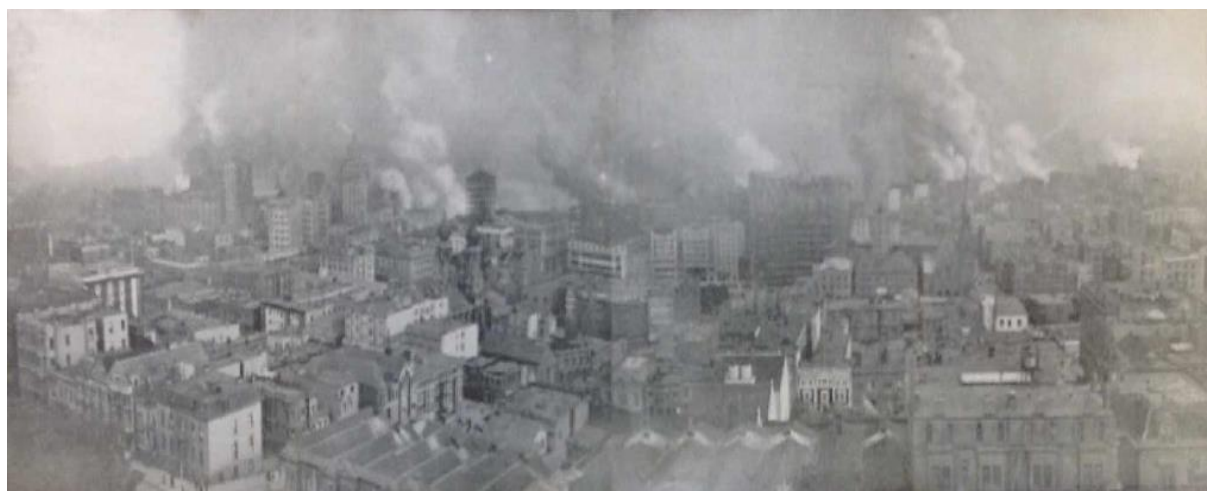
Fig. 5. San Francisco, California, 1906. U.C. Berkeley Bancroft Library Manuscripts Collection, Hart Hyatt North: BANC MSS 81/55c. (accessed December 10, 2014)

In 1906, the infamous San Francisco earthquake and fire destroyed the vast majority of the city, leaving over 3,000 dead, 225,000 injured, and hundreds of thousands homeless.<sup>1</sup> The 7.8 magnitude earthquake ruptured nearly all of the water lines beneath the city, making the fire virtually impossible to extinguish.<sup>2</sup> As figures 5 and 6 demonstrate, Chinatown, like the rest of the city, was burnt to the ground, leaving little to nothing that could be salvaged. The vast majority of those who lived in the San Francisco Chinatown fled to the nearby Oakland Chinatown for refuge.<sup>3</sup>