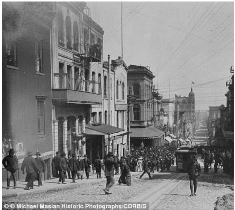
Fig. 7. Michael Maslan, Grant Street, 1885. Photograph, CORBIS, San Francisco, California. (accessed December 10, 2014)

marked with stone lions to seem more "authentically" Chinese.<sup>13</sup> It is because of his efforts that such faux-Chinese aesthetics, such as those depicted in figures 7, 8, and 9, are still seen today in the San Francisco Chinatown, and in other Chinatowns around the world.<sup>14</sup>