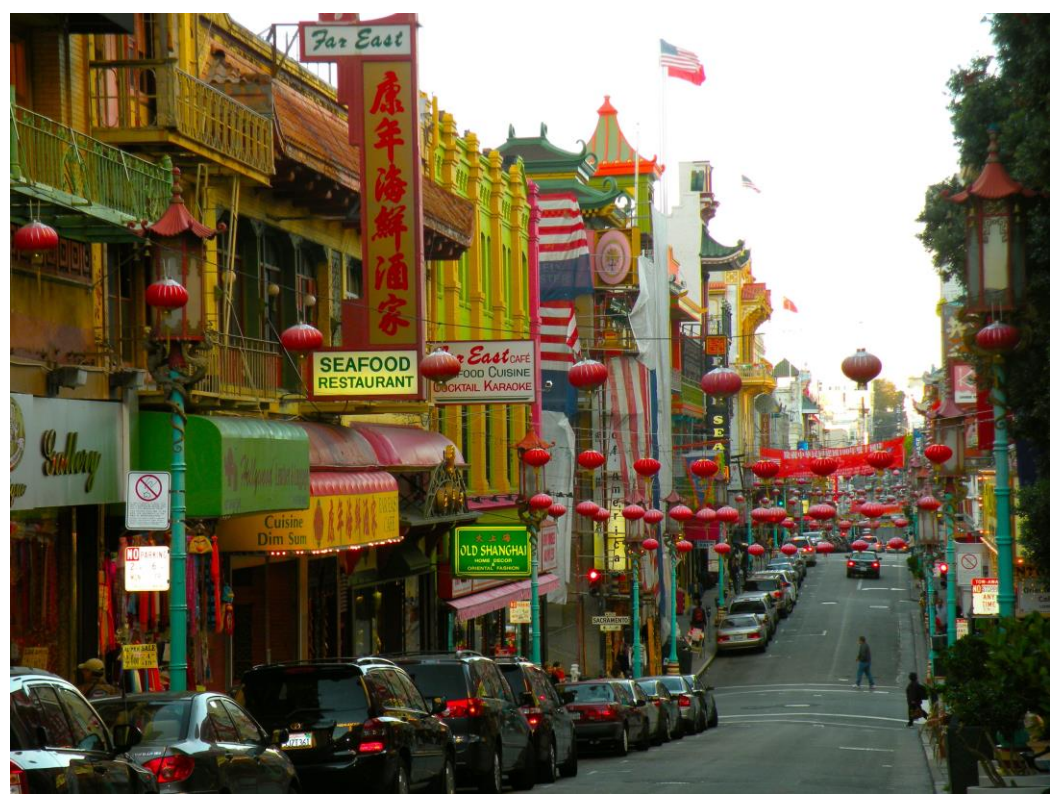
Fig. 9. David Gilmore, Grant Street, 2012. Photograph, David Gilmore's Studio. (accessed December 10, 2014)