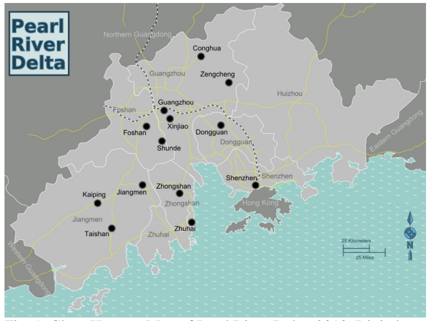
Fig. 1. Claus Hansen, Map of Pearl River Delta, 2010, Digital image.

trade through Guangzhou and the ports of Hong Kong, providing steady economic activity for the surrounding area. For those smaller communities in the rural countryside however, sugarcane became a major source of income and stability.<sup>6</sup> Faced with a growing population, many Chinese farmers expanded their sugarcane fields in order to claim land and establish their legitimacy by employing villagers from the surrounding area to tend to their crops.<sup>7</sup> With the rise of a money economy and the growing commercialization of agriculture, farms grew bigger and food crops like rice were increasingly replaced by cash crops like tobacco and indigo.<sup>8</sup> This, ultimately, had devastating consequences on the economy and stability of the area after the First Opium War.