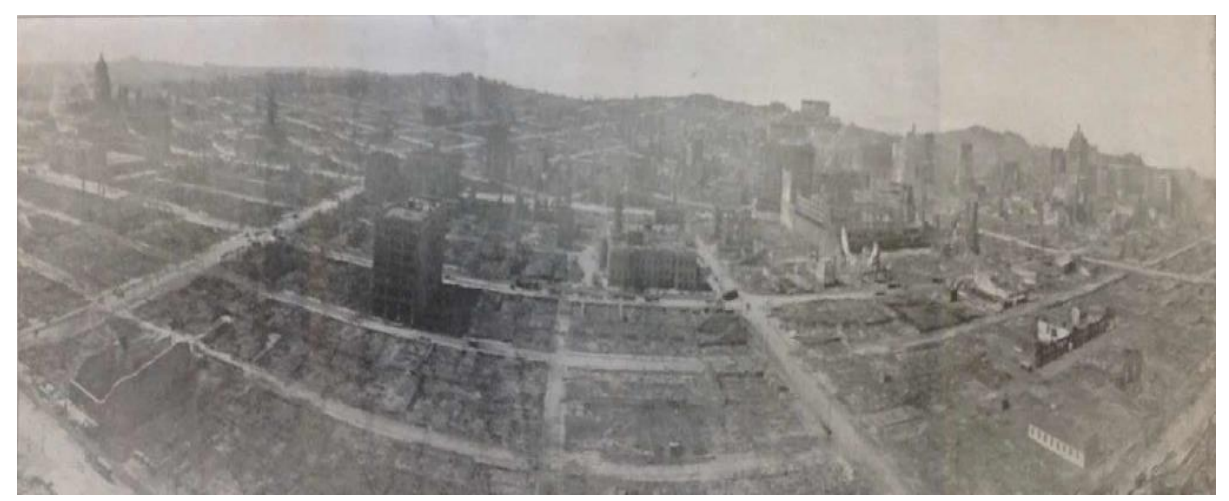
Fig. 6. San Francisco, California, 1906. U.C. Berkeley Bancroft Library Manuscripts Collection, Hart Hyatt North: BANC MSS 81/55c. (accessed December 10, 2014)

The city's eventual reconstruction started almost immediately after the devastation ended, but as this chapter will demonstrate, the organization of the city prior to that point, the physical placement of Chinatown within the city, and the former processes Chinese immigrants had to endure in order to enter the country all became subjects of debate and major areas of change. All three of these aspects are crucial for understanding the significance of the city's reconstruction because they establish how the San Francisco earthquake and subsequent fire affected the local Chinatown and Chinese immigration as a whole. This chapter argues this change was predominately prompted by first generation Chinese immigrants and second generation Chinese Americans in their resistance to the government's proposed relocation of Chinatown; through their involvement with the Benevolent Six Companies, several Chinese-American organizations, local Catholic and Protestant churches, the California education system, local politics, connections with local businesses, and communications with Chinese diplomats, both the men and women of the Chinese communities ultimately drove the decision to rebuild the San Francisco Chinatown in the same location. Furthermore, this chapter argues that the anti-Chinese sentiment these communities were responding to reflected the local population's interests and