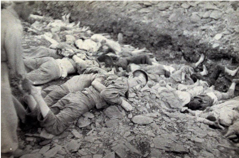
Fig. 2. Associated Press. Execution of South Korean Political Prisoners . c. July 1950. Digital image. Boston Globe, Boston. http://archive.boston.com/bigpicture/2010/06/remembering_the_korean_war_60.html

frequently included in the executions is likely. As the American and South Korean militaries began to retake the south, their attempts to thwart communist guerrillas caused soldiers to regard Korean civilians suspiciously. By the time the ROK would retake Seoul, the US military had already decided to use force against suspected communists, regardless of their status as civilians.