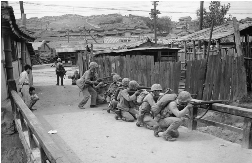
Fig. 4. Dresfor, Max. US Marines hiding from communist snipers. Sep 27, 1950. Digital image, The Atlantic, Washington, D.C. https://www.theatlantic.com/photo/2016/02/the-extraordinary-career-of-photojournalist-max-desfor/470373/