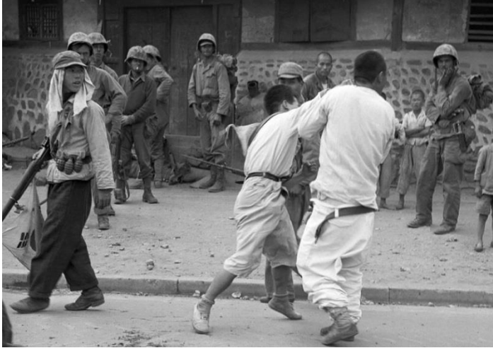
Fig. 7. Dresfor, Max. One Man Striking a Supposed Communist Sympathizer . Sep 27, 1950. Digital image, The Atlantic, Washington, D.C.

https://www.theatlantic.com/photo/2016/02/the-extraordinary-career-of-photojournalist-max-desfor/470373/