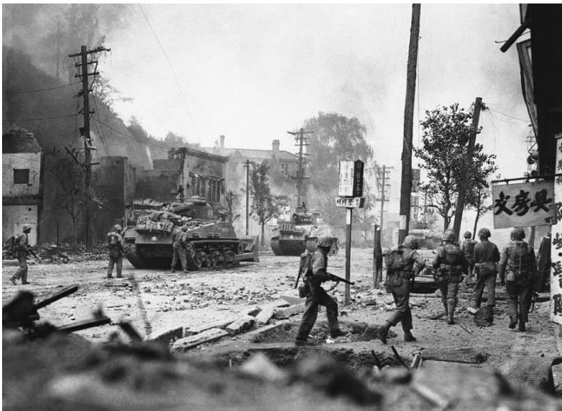
Fig. 5. Dresfor, Max. UN Forces in Seoul . Sep 27, 1950. Digital image, The Atlantic, Washington, D.C. https://www.theatlantic.com/photo/2016/02/the-extraordinary-career-of-photojournalist-max-desfor/470373/