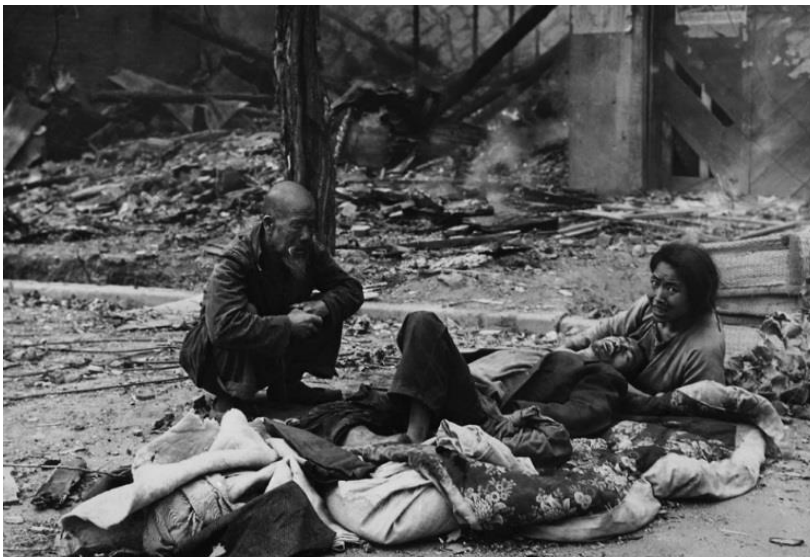
Fig. 6. Associated Press. Civilians in Seoul During the "Liberation." Oct. 7 th , 1950. Digital image. Boston Globe, Boston. http://archive.boston.com/bigpicture/2010/06/remembering_the_korean_war_60.html

By September 25 th , 1950, American and South Korean control of Seoul had been secured as US tanks poured into the area and communist forces fled north. With North Korean troops out of the way, the US and ROK governments began to concentrate on restoring the occupied areas. Experience in Germany and Japan had prepared the US army for the daunting feat of persuading local civilians to turn against the ideology of the defeated government. 60 With anti-capitalist and anti-imperialist education heavily pushed on Seoul's citizens throughout the three months of occupation, American and ROK forces worked to counter it. In figure 6, the state of Seoul's citizens after the battle can be seen.