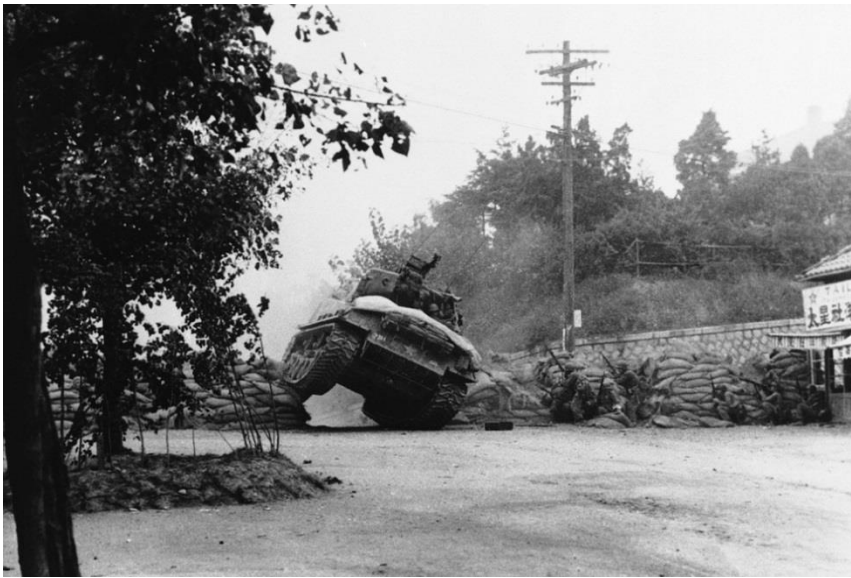
Fig. 3. American Tank in Seoul . Oct. 7 th , 1950.

The one part of the occupation that has received considerable attention from scholars, has been its conclusion. Part of this due to the excellent documentation of the military feats that overcome the communists. While the feats at Inchon have captivated historians, who have already exhausted the subject thoroughly, the military feat is significant to the narrative of the occupation, as it explains how the communists lost Seoul and what occurred during the final days of communist Seoul. Figure 3 demonstrates the beginning of the end for the occupation as American tanks crashed through communist barricades and entered the city.