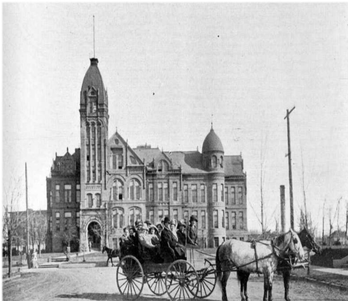
Barge Hall in 1912 (Building Photographs, 1912)