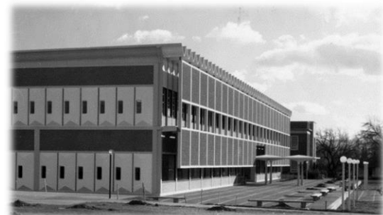
Bouillon Hall in 1960