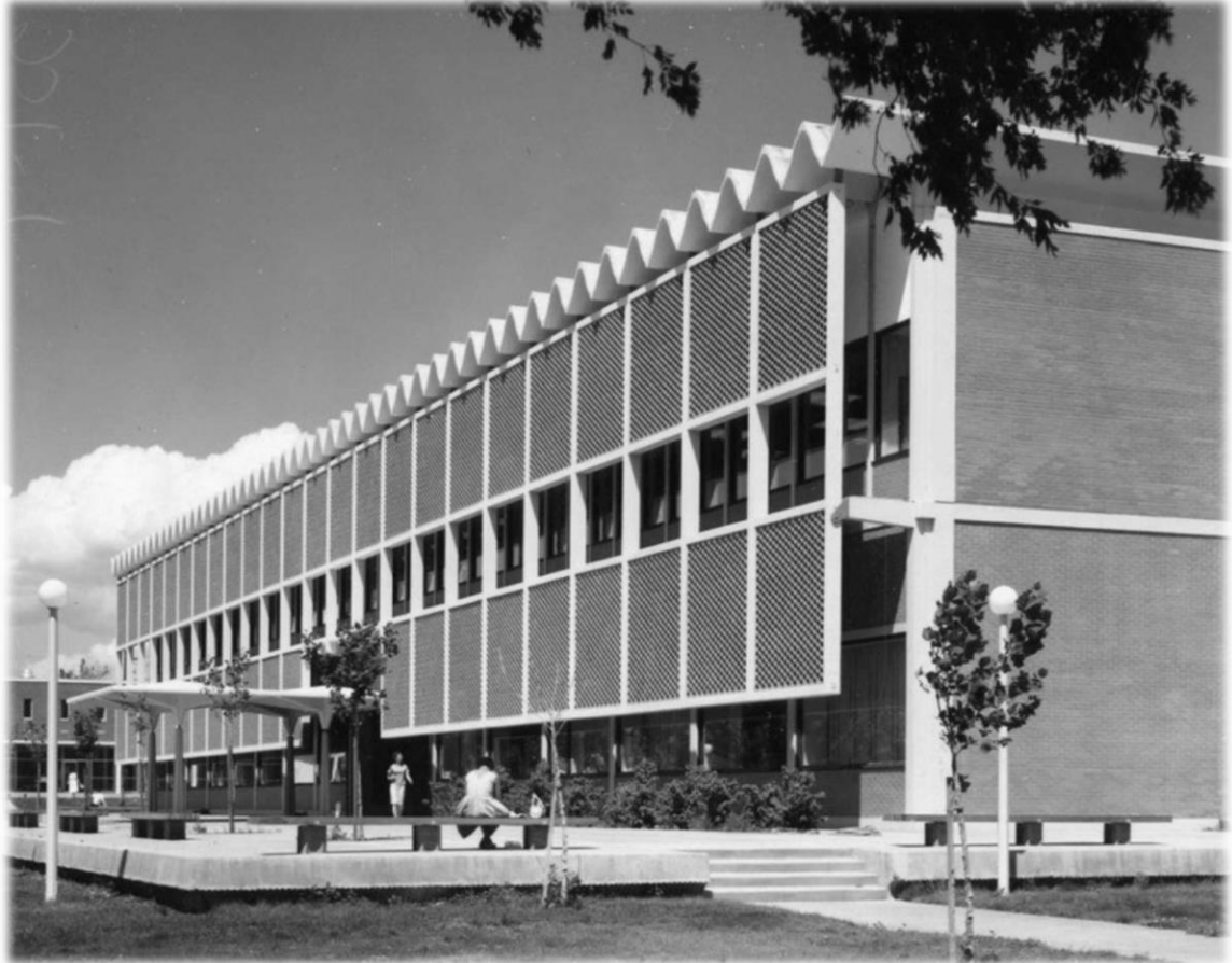
Bouillon Hall 1961 (Building Photographs, 1961)

Before the university goes on winter break, we have been busy keeping up with the last winter schedule changes and clearing out the inbox.