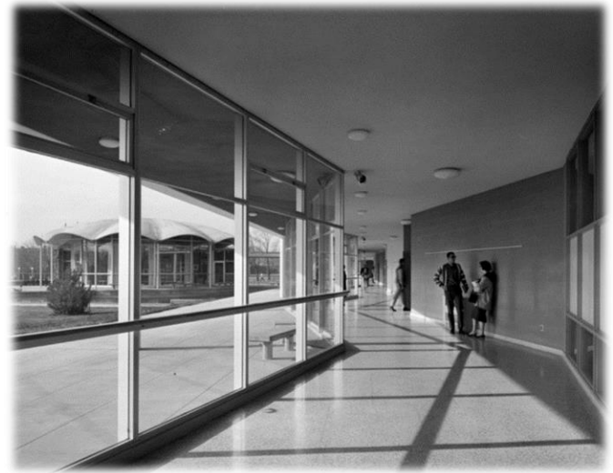
Black Hall, 1960