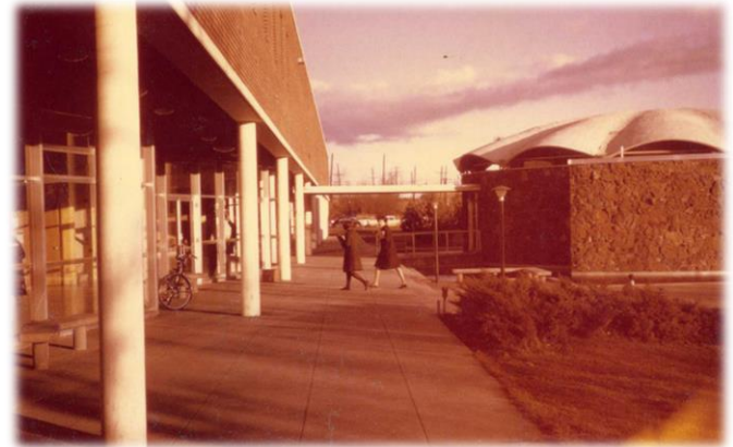
Black Hall, 1965