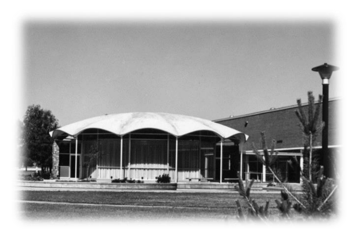
Grupe Conference Center 1960 & 1965