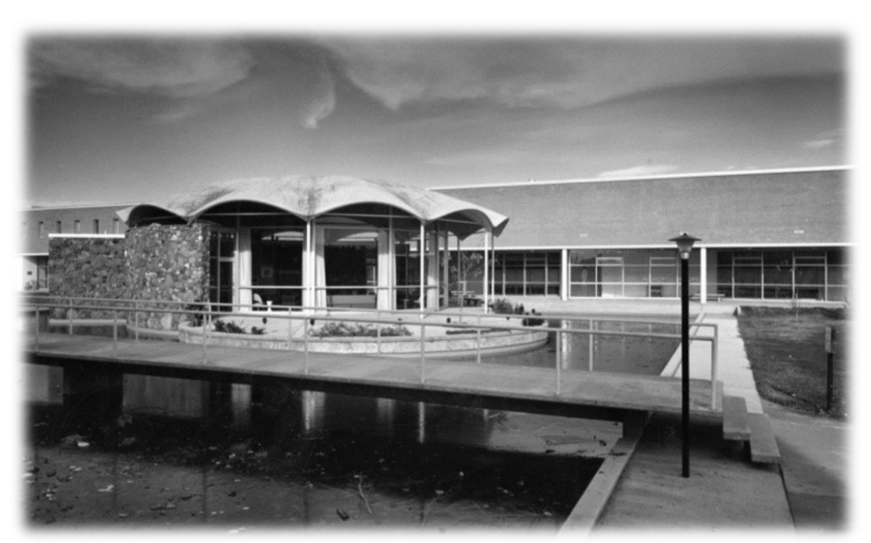
Grupe Conference Center 1965 (Building Photographs, 1965)