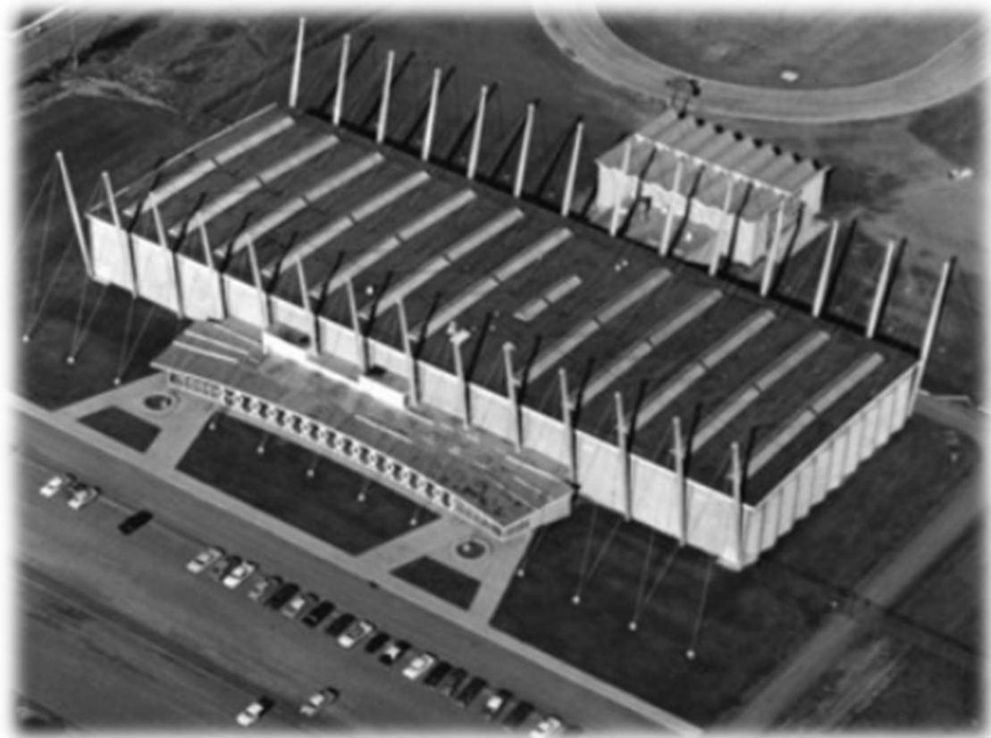
Nicholson Pavilion 1960 (Building Photographs, 1960)