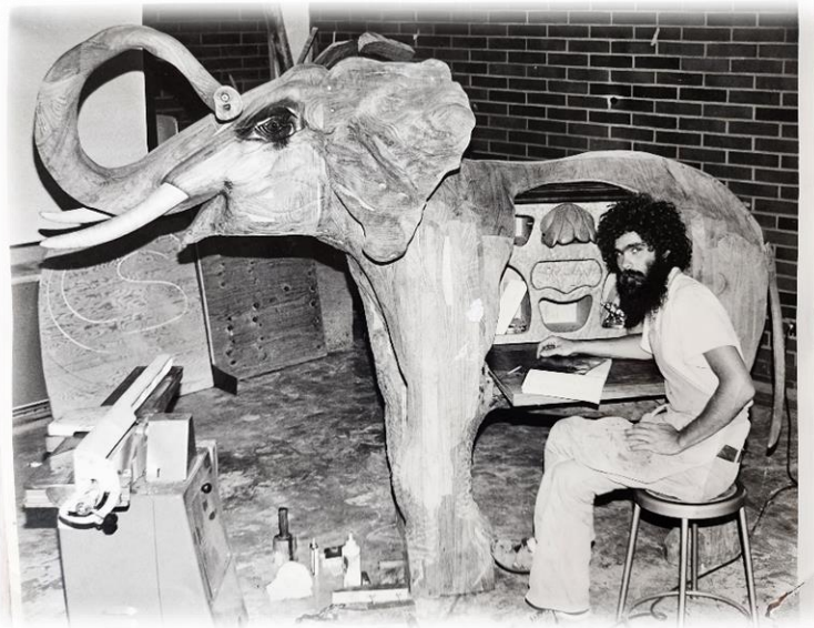
Sculpted by Chris Schambacher

This desk is located at the top of the East staircase in the Science Building