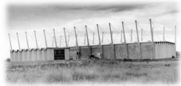
Nicholson Pavilion in 1960