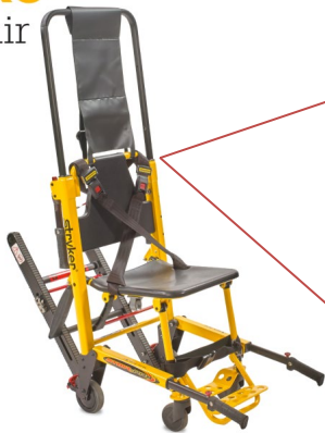
Stair-PRO® stair chair